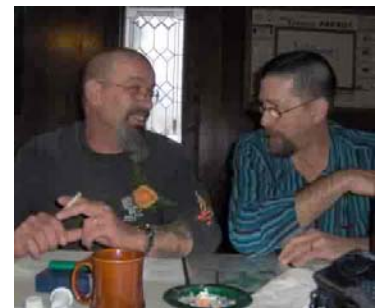
Is it just me, or are these guys lookin' more alike every day???